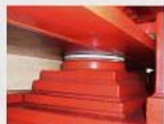
すべり免震支承 Sliding base isolators