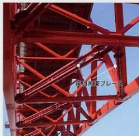
座屈拘束ブレース Buckling-restrained braces

The floor system, or bridge decks on which vehicles travel, of the Minato Bridge was previously supported by metal bearings. They have been replaced with sliding base isolators to reduce the seismic force, thereby preventing damage to the main truss which is the framework of the bridge consisting of main or primary members. The other feature of the retrofit on this bridge was the adoption of a damage control system. Sway bracing, bottom lateral bracing and other secondary or supplementary members are designed to withstand damage to a certain degree so that they absorb seismic energy and keep the primary members intact. This seismic control has been achieved in practice by replacing old sway and bottom lateral bracings with buckling-restrained braces which are capable of absorbing seismic energy without buckling (crumpling under strong compression from both ends).