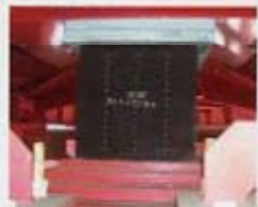
積層ゴムばね Laminated rubber spring